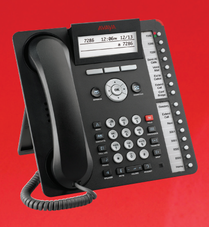
1616-I IP Deskphone